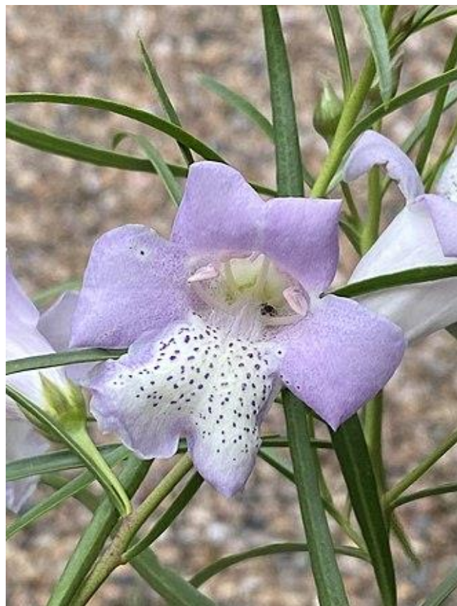
E. bignoniiflora

There were a good number of Eremophilas on display among them E. cuneifolia (see Plant of the Month), mackinlyi , maculata , calorhabdos , decipiens , bignoniiflora and 'Meringur Midnight'