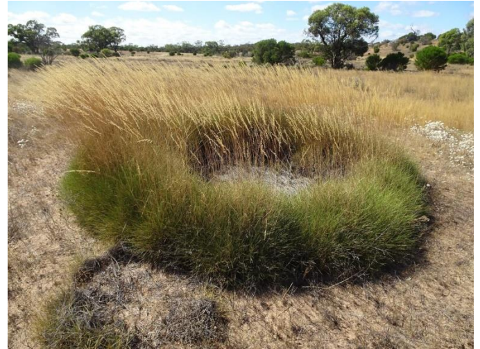
Triodia at Raakajlim