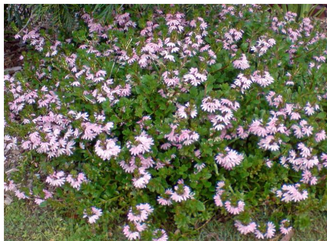
Scaevola 'Bombay Pink'

Other notables were Lambertia formosa and L. ovafolia , interesting upright flowers of red and yellow; Swainsonia greyiana , with very deep, royal purple flowers and several Scaevolas . Scaevola striata is a vigorous ground-cover with deep, rich blue flowers, S. crassifolia is a dense shrub with sticky foliage and pale blue flowers. S. aemula comes in a variety of colours from deep purple through mauve, blue to white. Our specimen was a delicate pink and may have been one of the many pink varieties – Bombay Pink, Whirlwind, Sitting Pretty etc.